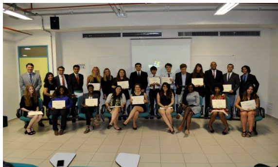
July group class 2015 at UNIP building