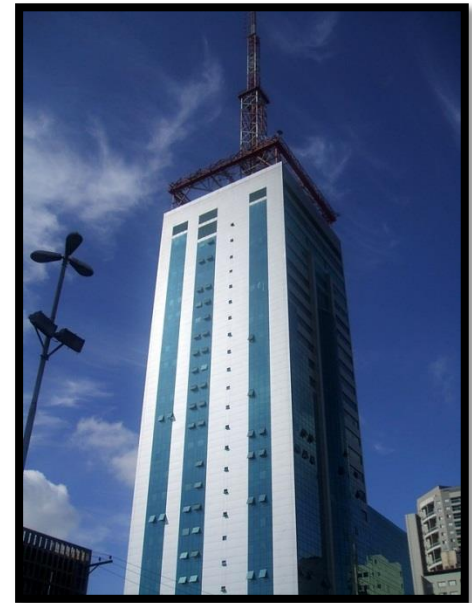
UNIP New Campus Center