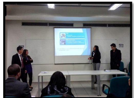
Final project presentation