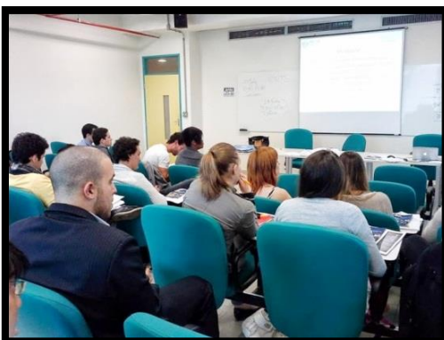
Students attending the class