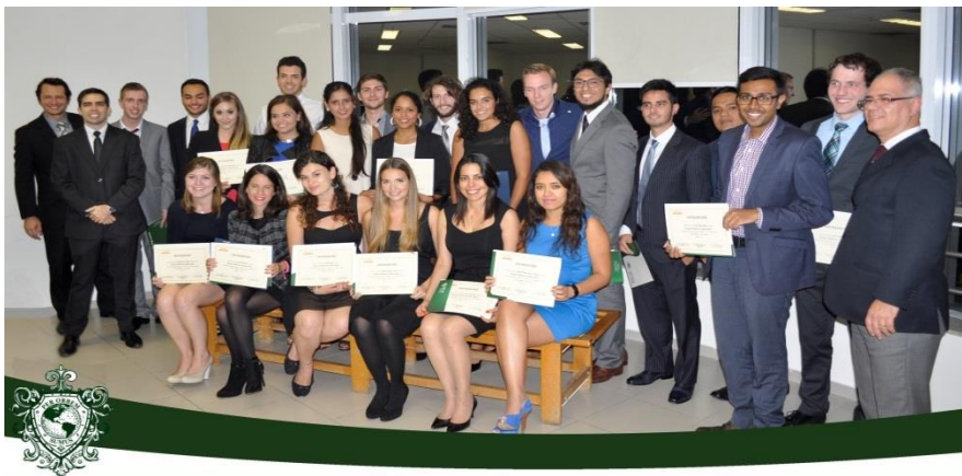
August group class 2015 during the Graduation Ceremony