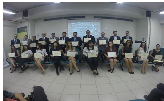
January group class 2016 at UNIP building

If you want to know our students' opinion about the program, visit: