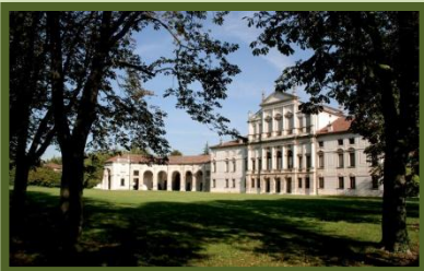
The Campus site of CUOA in Europe

Taking place between the ordinary school semesters, our program allows students to participate without interrupting their ongoing studies and breaking professional bonds.